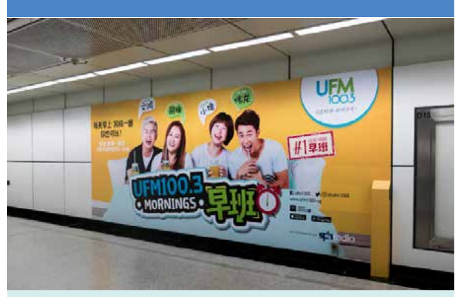
Pricing varies, check with Campaigner for costing

*Minimum campaign period of 4 weeks applies unless otherwise stated. Production work will be done by Moove Media.