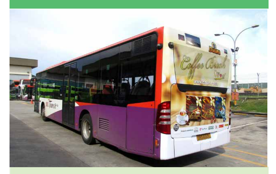
4-WEEKS MEDIA Satellite/Heartland/Multi-Route $1,320 per bus

PRODUCTION COST $480+ per bus Customisation option with die-cut 2D top is available. Send us a vusual for a friendly quote!