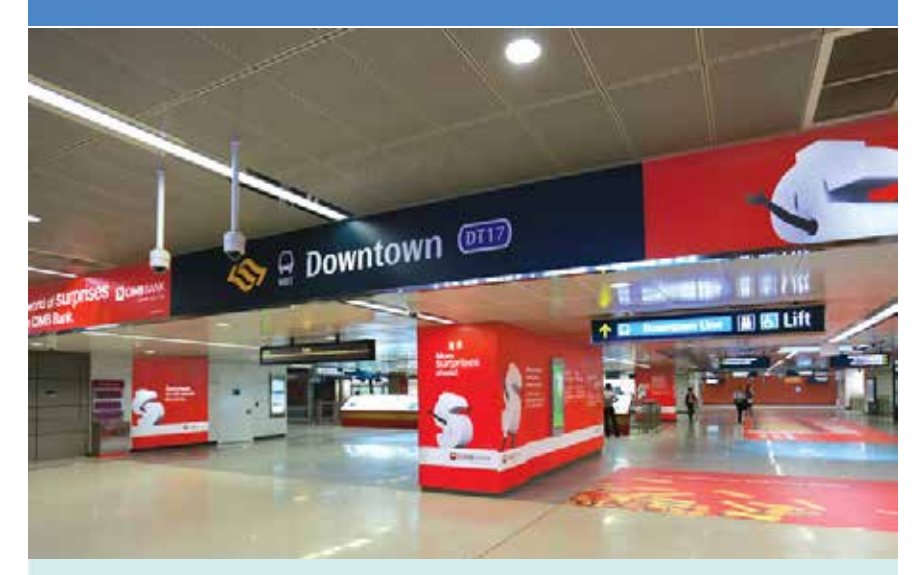
4-WEEKS MEDIA $100,000 to $150,000